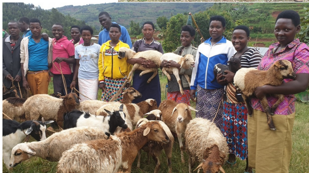
Youth from Ikirezi Rubaya Group (2019-C2) received sheep