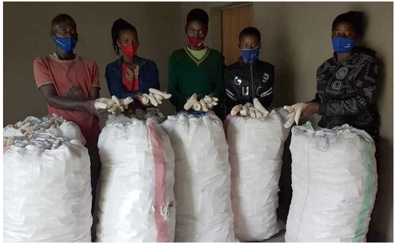
Above right: Duterimbere Kinazi Group (2019-C1) harvested cassava, to be dried and processed.