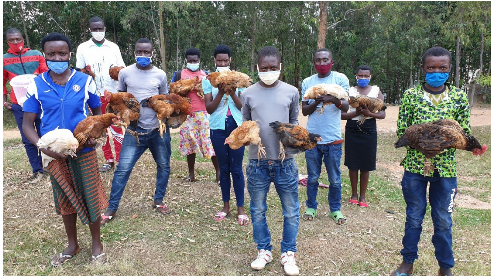
Twitezimbere Group (2020-C1) breed and sell hens

Zoe provides initial resources for crop production and keeping livestock and then the youth maintain and increase these projects both as individual and group activities. During this reporting period, the Zoe families planted various types of food and cash crops. The harvest was enough to provide food security for the families with surplus to sell at markets. (In the pictures below, the date following the group name indicates when they entered into the Zoe program. C1 indicates class 1 groups which started in January, C2 groups started in July.)