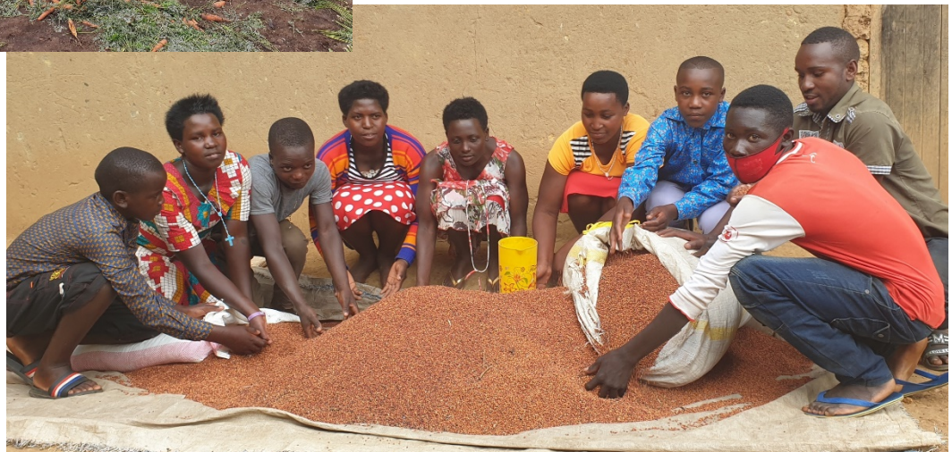
Below: A sub-group from Tuzamurane Rubaya (2019-C2) created a business of sorghum selling