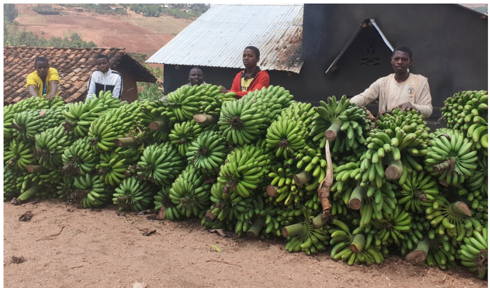
Umuryango-Inshuti-Twuzuzanye (2018-C1) harvested banana