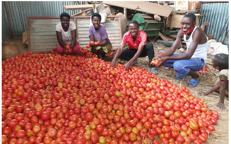
Above: Umuryango Musha Group (2018-C1) harvested tomatoes