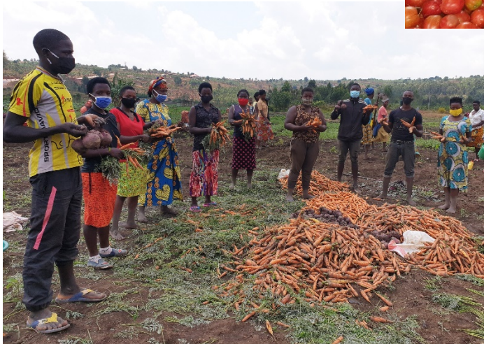
Left: Ubumwe, Urumuri, and Tuzamurane Groups of the Kibirizi area (2020-C1) harvested carrots and beetroots